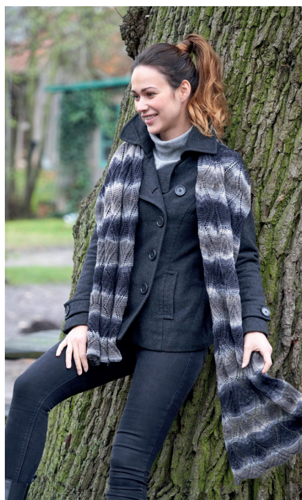
NAEMIE S11065 | Magazin 043 Merino Moments