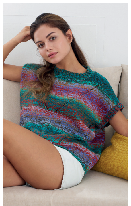
ETANA S11297 | Magazin 047 Summer Trends